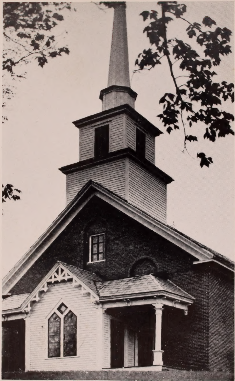
Baptist Church, So. Londonderry, Vt.